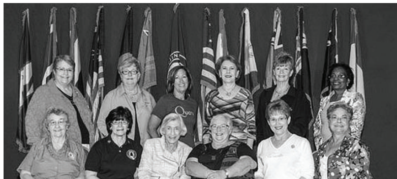
Past International Presidents at the 2014 International Convention