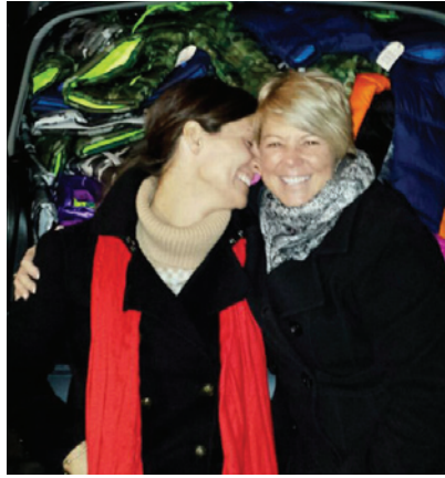
The "Keep the Children Warm" project in Winchester, VA, United States is managed by dedicated Quotarians.

On 12 December 2014, the United States Congress passed the National Women's History Museum Commission Act. The act is designed to create a commission for the establishment of a National Women's History Museum in Washington, DC to raise awareness and honor women's diverse experiences and achievements. The bipartisan nature of the legislation is noteworthy in a time of partisan and political gridlock in Washington. The act now awaits President Obama's signature.