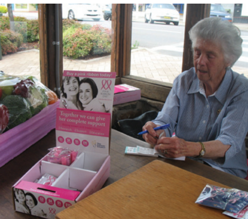
Grassroots activism takes many forms around the world when a cause—like breast cancer awareness—affects so many.

Quotarians around the world are providing educational opportunities to women in traditional and nontraditional ways. In Ba, Fiji , education on basic hygiene practices are provided in the Natisiri Settlement. In Mandaue, Philippines , vocational training is offered to the deaf and hard-of-hearing. In Legazpi-Mayon, Philippines , the deaf, hard-of-hearing, and young mothers are being prepared to become active workforce participants through Quota International's Stitch for a Living project. Equipped with a new sewing machine, graduates are able to start their own businesses and provide for their families.