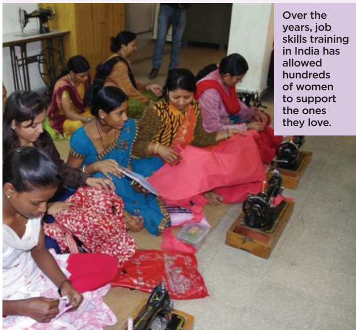
Over the years, job skills training in India has allowed hundreds of women to support the ones they love.