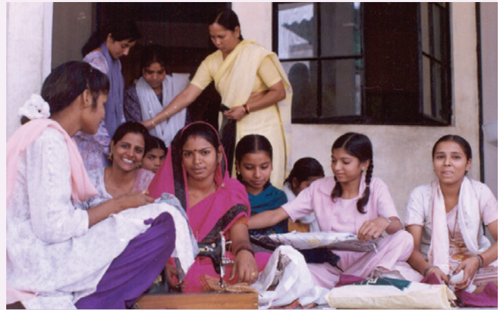
Self-sufficiency and economic independence is at the heart of the women's programs flourishing in India.

The wages, provided by donations made to Quota International's World Service